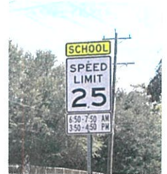
Avoyelles High School